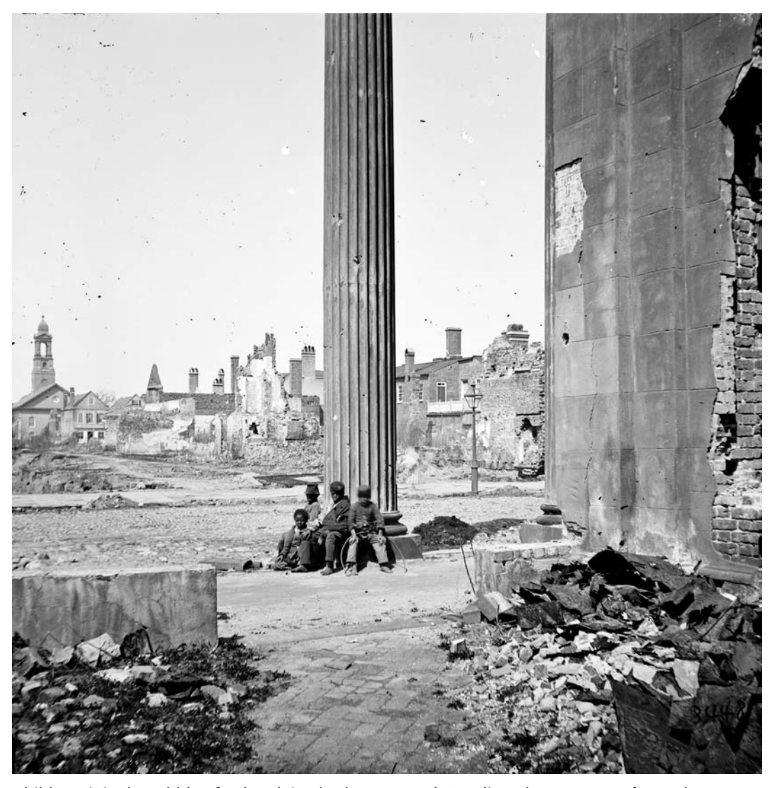
Children sit in the rubble of a church in Charleston, South Carolina, that was one of countless buildings destroyed during the Civil War.

Union leaders knew that the Confederate troops counted on support from white landowners as they fought their way across the South. The cities,