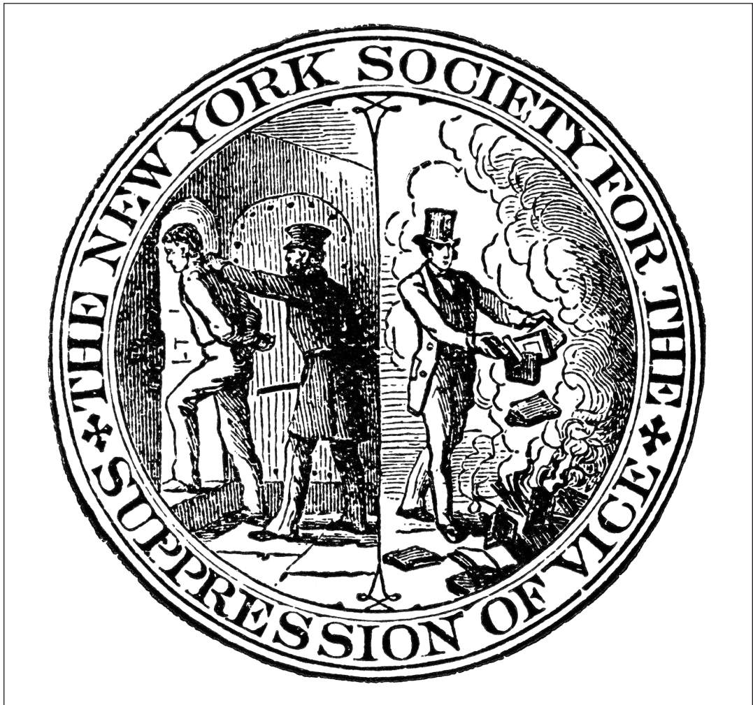
The New York Society for the Suppression of Vice was committed to ridding the city of what its members viewed as immoral and obscene.

of Greenwich Village—emerged as a place where they could gather and socialize somewhat openly. New York was large and bustling enough that LGBT people could remain anonymous, yet its sizeable gay population meant that they could also find camaraderie and safety in numbers. As a major cultural center, New York attracted actors, artists, poets, musicians, radicals, and other individuals who took pride in their eccentricities. Many of these people settled in Greenwich Village, which gained a reputation as particularly tolerant and wel-