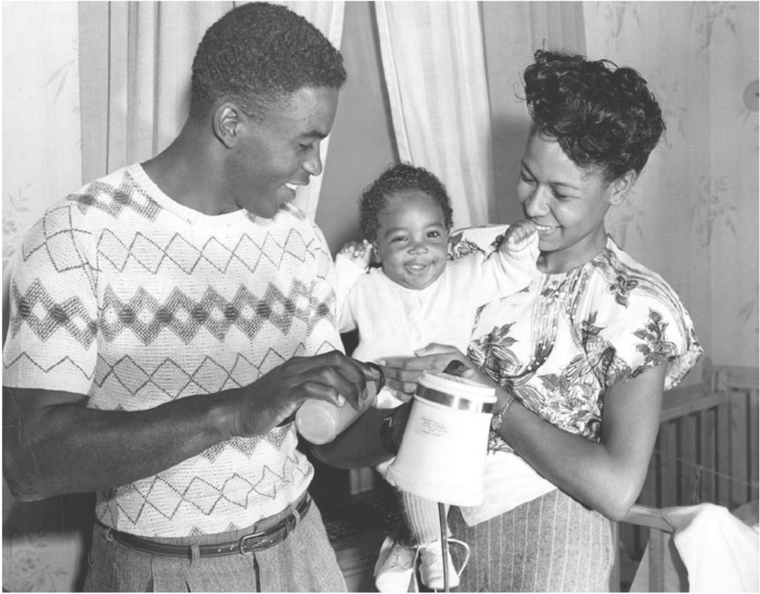
Robinson and his wife, Rachel, welcomed their first child, son Jackie Jr., shortly before he joined the Brooklyn Dodgers.

ed to relocate spring training to the racially diverse Caribbean island nation in order to avoid some of the discrimination that Robinson had encountered the previous year in Florida. He hoped that the move would reduce some of the pressure on Robinson, give him time to get to know his future teammates, and ease his transition into the big leagues.