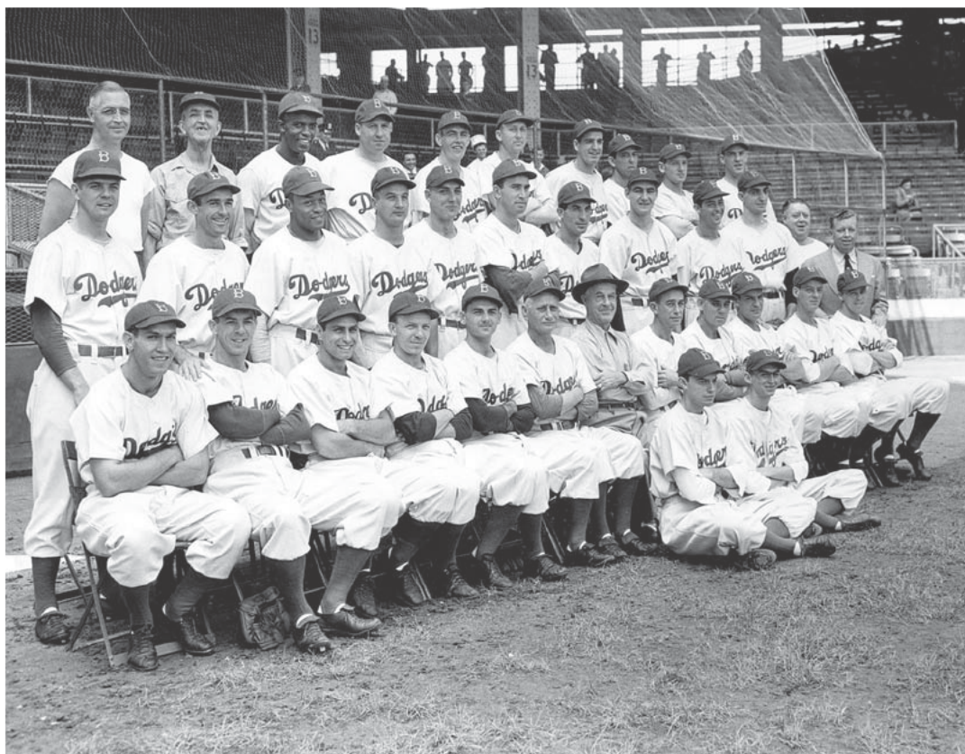
Robinson (back row, third from left) made his debut with the Brooklyn Dodgers on April 15, 1947.