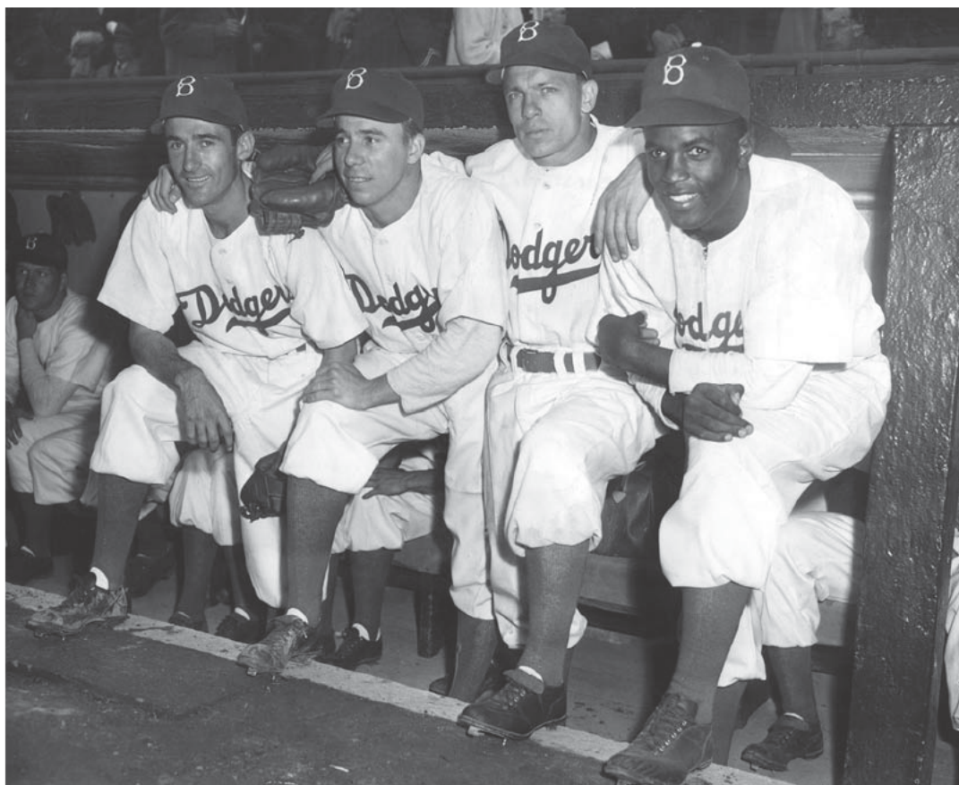
During his rookie season, Robinson gradually gained the support of Dodgers teammates like (from left) Spider Jorgensen, Pee Wee Reese, and Eddie Stanky.