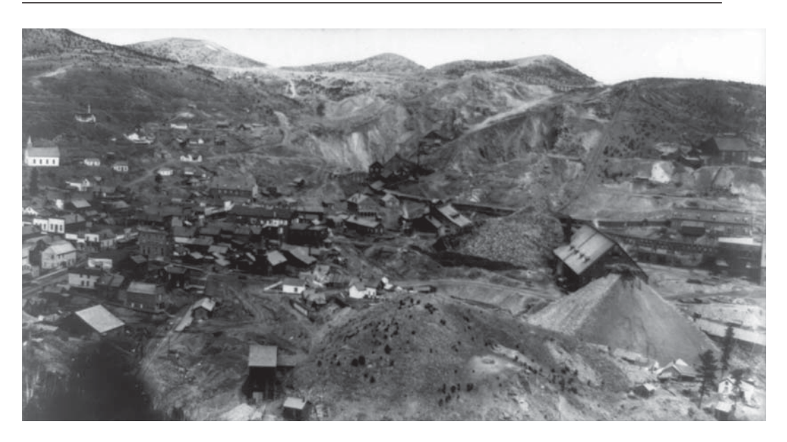
Lakota tribes were pried off their lands in the Black Hills to make way for white mining towns such as Lead City, seen here around 1890.

were blocked by non-Indian reformers. Then the officials came up with a new scheme to take control of reservation lands. Under the General Allotment Act of 1887, also known as the Dawes Act, they proposed distributing a plot of reservation land to the head of each Lakota family. Anyone who claimed an allotment of land and lived there for twenty-five years would be granted U.S. citizenship. Once all of the eligible Lakota tribal members had claimed their allotments, the government planned to sell off any "surplus" reservation land to white homesteaders. The money from the sale of the land would be used to fund Indian education and employment programs. The Dawes Act gained the approval of non-Indian reformers, who believed that "the law would replace tribal ownership with individual ownership, get the Indians to farm, and solve the problem of what to do with them,"<sup>10</sup> as one historian explained.