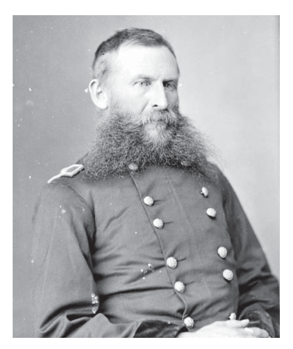
General George Crook was a tenacious Indian fighter, but unlike most of his fellow officers in the U.S. Army, he treated Indians as tough adversaries worthy of respect.

threats, promises, and bribes, Crook gathered the signatures of 4,463 of the 5,678 eligible Lakota voters, giving the allotment plan the three-quarters majority needed for approval.