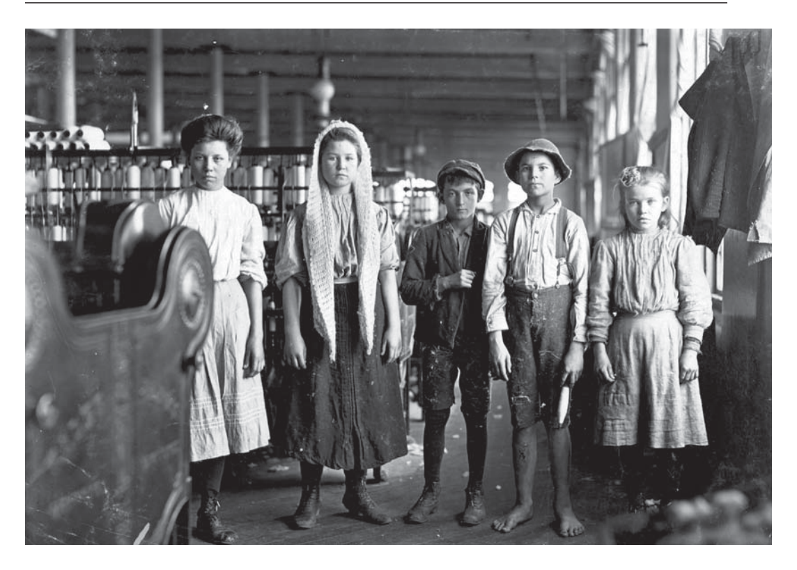
Child employees at a cotton mill in South Carolina in 1908.

ily had to pitch in," summarized one history of the era. "After school and on weekends, youngsters helped with piecework at home or took over household chores so their mothers could go out to work. Children peddled newspapers, sold chewing gum, shined shoes, or ran errands to bring in extra income. Millions of other children joined the ranks of adult laborers and worked ten to twelve hours a day in textile mills, glass factories, canneries, and coal mines."