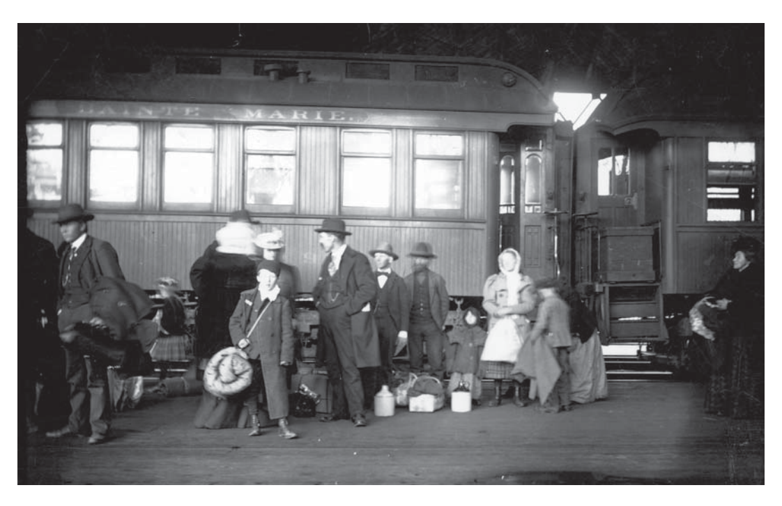
Immigrants wait to board a train in Minneapolis, c. 1910.

America's all-powerful railroad industry played a central role in these campaigns. The Iron Horse, as the locomotive was often called, completely reshaped the economic and societal character of the United States during the nineteenth century. This exciting technology made it much easier for manufacturers and farmers to send their products to market, allowed harvesters of coal, timber, and other natural resources to penetrate the most remote corners of the continent, and made coast-to-coast travel a practical reality for the first time. Railroad promoter and land speculator William Gilpin spoke for millions of nineteenth-century Americans when he declared that "railways, multiplied and spanning the continent, are essential domestic institutions—more powerful and more permanent than law, or popular consent, or political constitutions. They thoroughly complete the grand system ... which fraternizes us into one people." 10