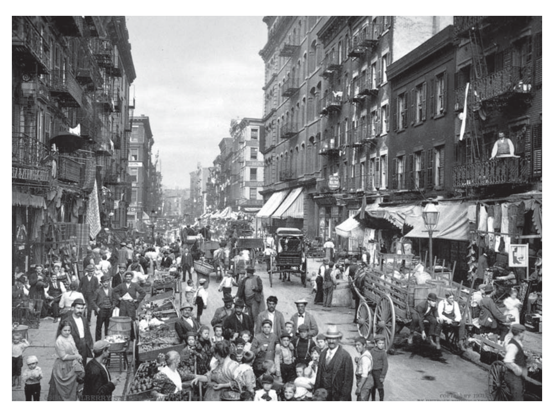
Vibrant and crowded ethnic neighborhoods sprouted all across New York City during the great Age of Immigration.

housing patterns, its religious and political life, and its cultural flavor were all reshaped by the steady influx of individuals and families from Italy, Ireland, Russia, Austria-Hungary, Germany, Romania, Greece, and numerous other places. Of all the nation's metropolitan areas, New York City became its truest "melting pot"—a place where many different nationalities and ethnicities blended together. By the close of the nineteenth century, New York City contained 3.5 million people, more than twice as many residents as any other American city. Of this total, more than 80 percent were first- or second-generation immigrants. This influx became so great by 1900 that "in New York alone there are more persons of German descent than persons of native descent, and the German element is larger than in any city of Germany except Berlin," reported sociologist Robert Hunter. "There are nearly twice as many