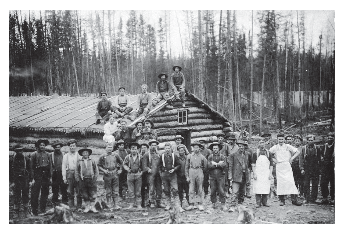
Finnish-American loggers pose at a Great Lakes timber camp, c. 1915.

millions of restless Europeans. U.S. railroad giants sold hundreds of thousands of tickets each year to European immigrants. Many of these tickets were package deals that included steamship passage to Ellis Island or other major points of entry.