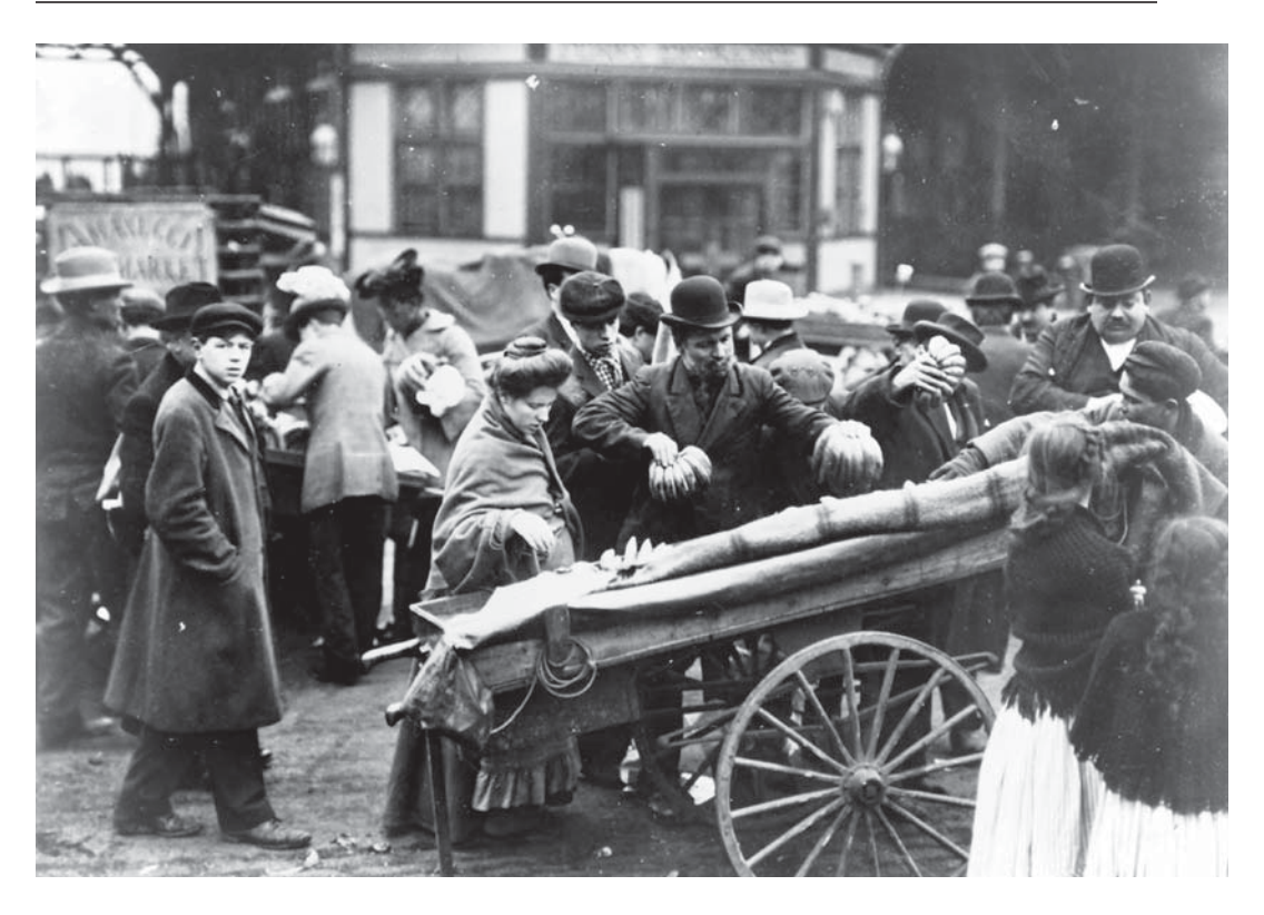
Some Italian immigrants supported themselves in America as fruit vendors, selling their wares at open-air markets.

me for help," recalled a Jew who emigrated from Russia in 1908. "It wasn't a question of money, it was a question of being a human being to a human being. And in those days people were apparently that way. There were so many nice people that were trying to help us when we came to this country." <sup>17</sup>