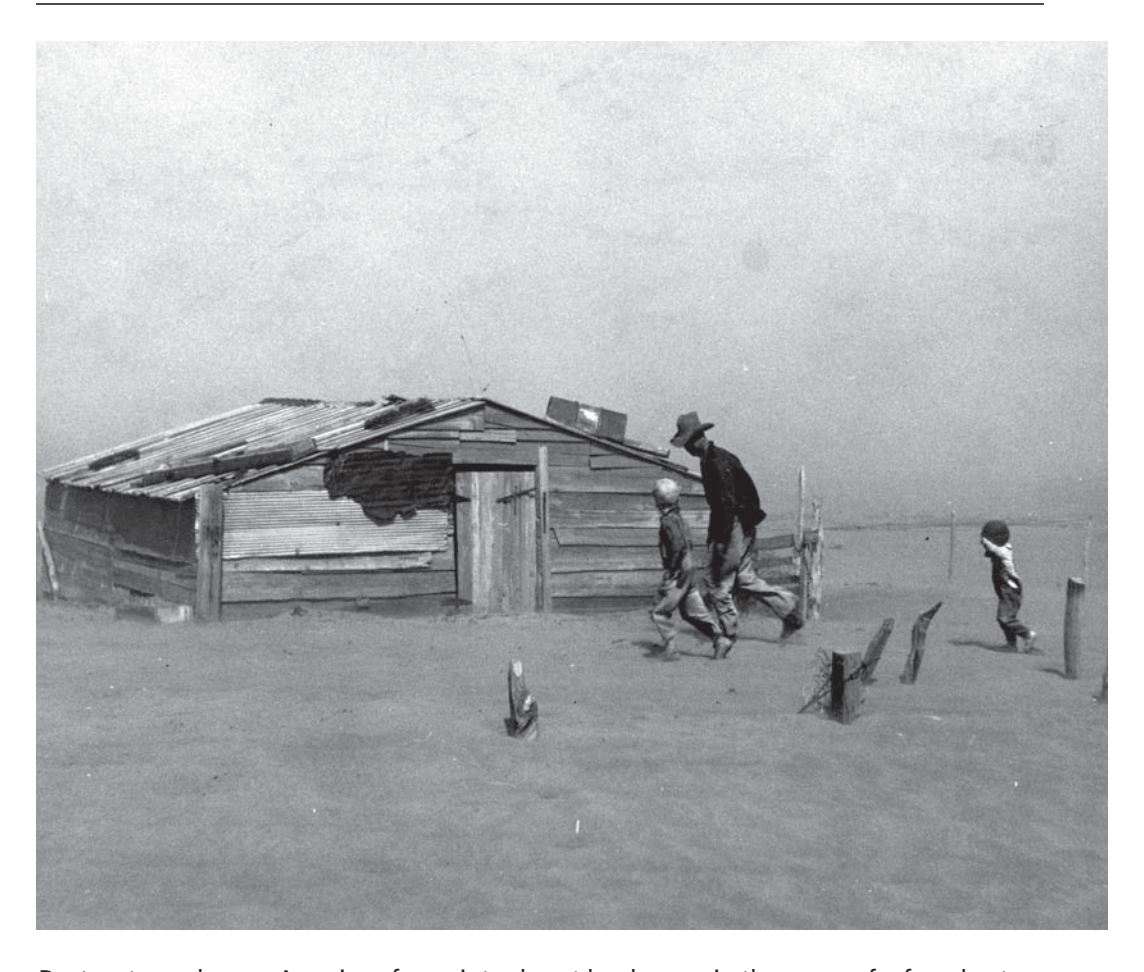
Dusters turned many American farms into desert landscapes in the space of a few short years.

destroying force beyond my wildest imagination." And over time, the conditions took a physical as well as psychological toll. "The dust I ... labored in all day began to show its effects on my system," he continued. "My head ached, my stomach was upset, and my lungs were oppressed and felt as if they must contain a ton of fine dirt."