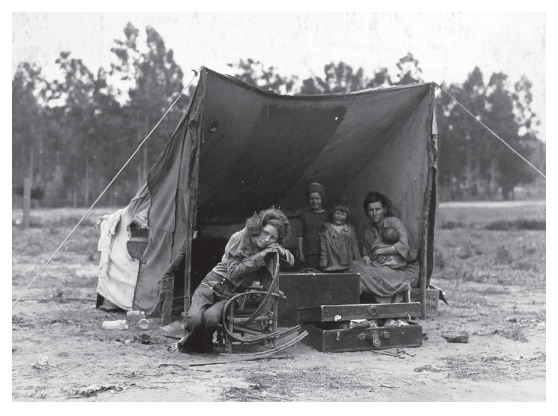
Miserable tent shelters such as this one often provided the only protection from the elements for migrant agricultural workers and their families.

bedding drenched by rain while he slept in the open, with topless car and a tire gone flat, an Oklahoman with the usual numerous dependents could say, 'Pretty hard on us now. Sun'll come out pretty soon and we'll be all right.'" <sup>13</sup>