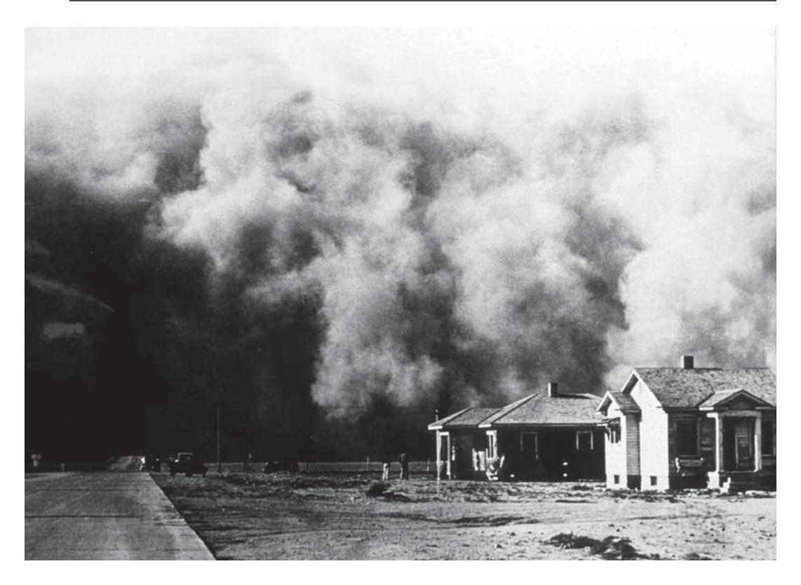
The worst of the dust storms that smothered America's Great Plains during the Depression was the Black Sunday storm of April 14, 1935.

skies over the Great Plains. A few of these storms were so gigantic that they deposited dirt from the Dakotas and Kansas and Oklahoma on windshields in New York City. Even ships hundreds of miles out in the Atlantic Ocean were coated with dust from the Great Plains.