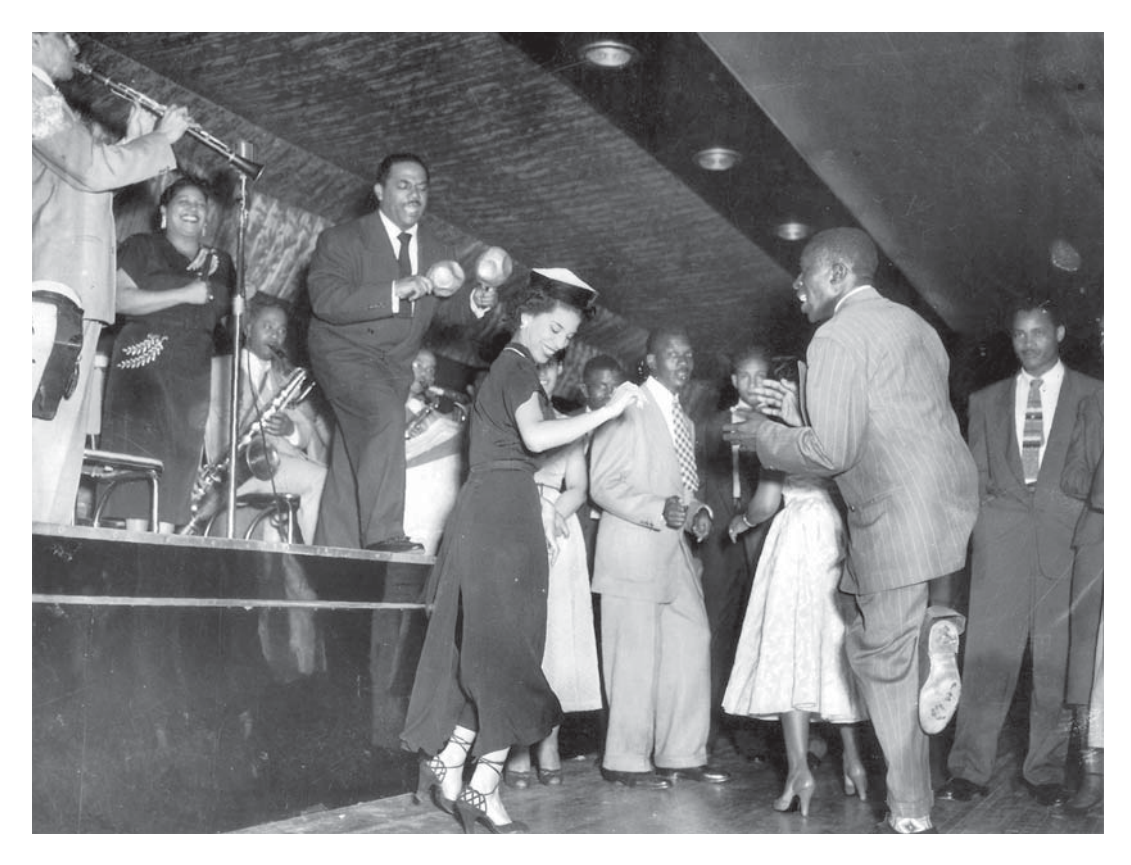
The Savoy Ballroom was one of the jewels of the Harlem nightclub scene during the Renaissance era.

The existence of the segregationist Cotton Club within America's most famous black neighborhood angered and frustrated many Harlem residents. The cabaret survived for only a few short years, though. One year after the Harlem riots of 1935, the Cotton Club moved to a new downtown location. Few Harlem residents were sorry to see it go. Four years later, it closed its doors forever.