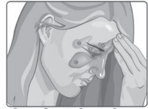
Figure 35.1. The sinuses are named for the bones that contain them.

Most people with sinusitis have pain or tenderness in several places, and their symptoms usually do not clearly indicate which sinuses are inflamed. Pain is not as common in chronic sinusitis as it is in acute sinusitis.