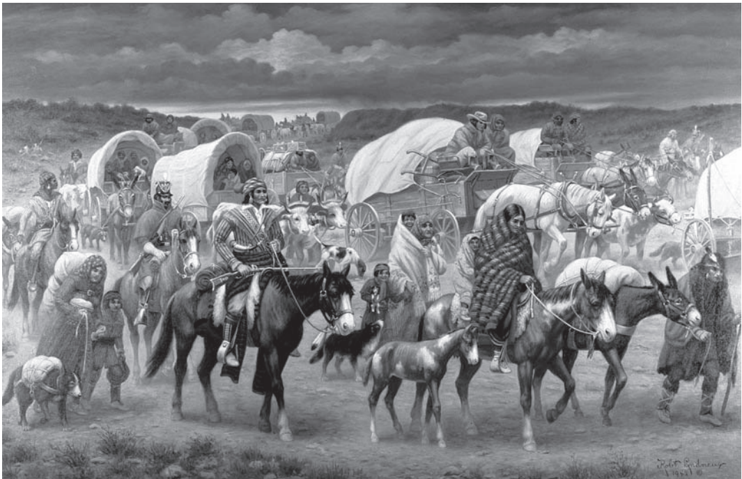
An artist's rendering of the 1838 Trail of Tears, in which the Cherokee Nation was forced by the U.S. government to leave their home in the American Southeast and relocate in Oklahoma Territory.

demoralized and divided tribe. The various factions came together to draw up a new constitution and form the United Cherokee Nation. In 1841 a new capital was established in Tahlequah. By the 1850s the Cherokee Nation once again had its own roads, businesses, newspaper, and public school system. Meanwhile, around 1,000 Cherokee in Tennessee and North Carolina escaped removal. Some lived on land owned by whites or protected by treaty, while others simply managed to hide. They gained federal recognition in 1866 as the Eastern Band of Cherokee Indians and established a tribal government in Cherokee, North Carolina.