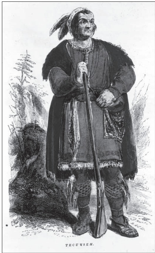
The famed Shawnee warrior Tecumseh led a formidable Indian uprising in the Ohio River Valley in the early nineteenth century.

Other tribes fought against the white invaders as well. Despite occasional successful raids against settlements and victories in skirmishes against white soldiers, all of these campaigns ended in defeats that left Indian nations in bloody tatters. The Black Hawk War of 1832 in the upper Midwest, for example, claimed the lives of hundreds of women, children, and elderly members of the Sauk and Fox tribes after warriors from those nations fought back against white incursions onto their lands.